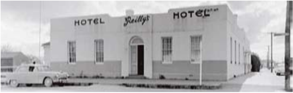
The Prince of Wales Hotel in Penola when it was named Reilly's.