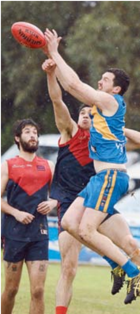
Hatherleigh and Port MacDonnell will go head-to-head in Round 17 of Mid South East football on Saturday. Picture: FILE IMAGE