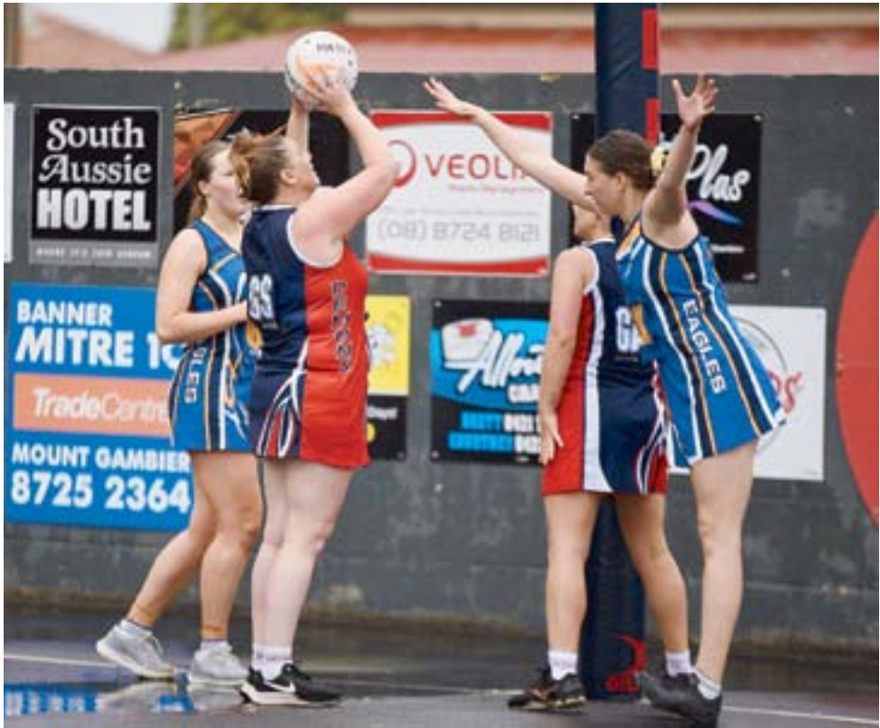
Port MacDonnell and Hatherleigh will do battle in the Mid South East netball match of the round on Saturday.