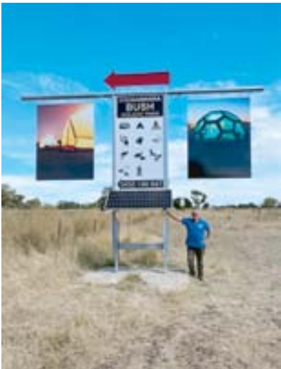
The sign in all its glory before it fell down.

Hundred of Grey- two townships (separate plans for both), the one near the railway was chosen, Moerlong.