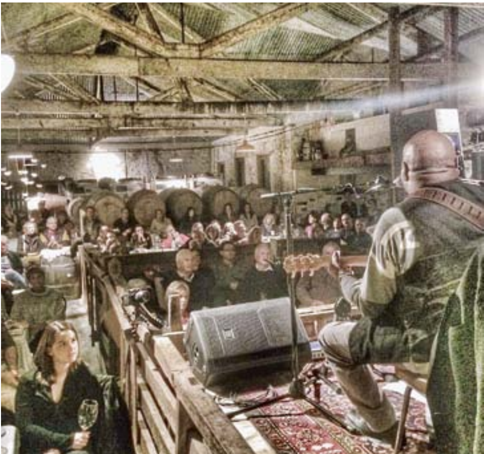
The late Archie Roach performing at Bellwether Wines at Coonawarra.

“His music and the lessons within will continue to teach future generations.”