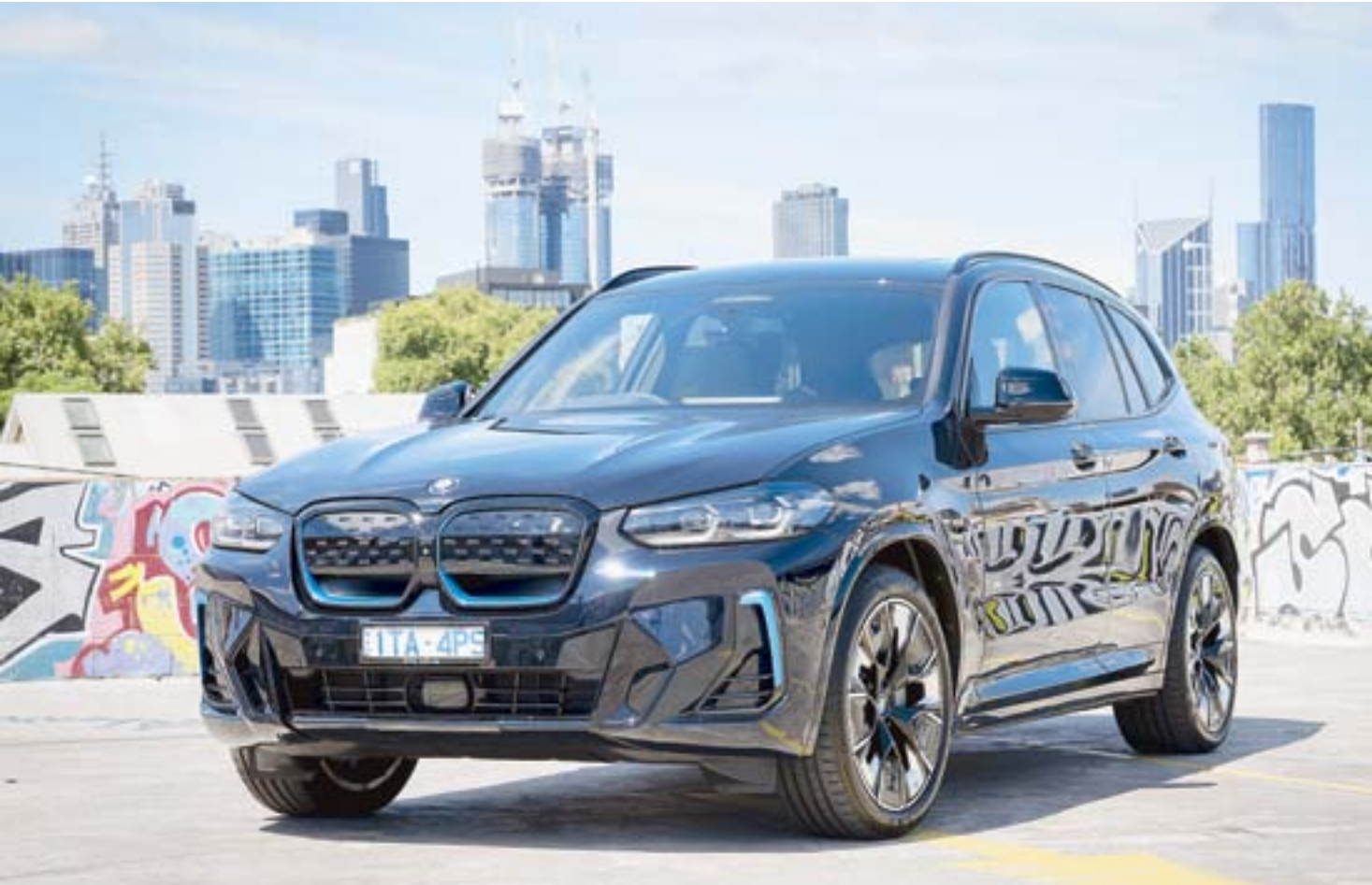
Fully electric: Though it's fully-electric, the iX3 looks like a Bimmer from any angle.

The BMW X3 has a five-star ANCAP safety rating from for the xDrive20d and xDrive30i vari-