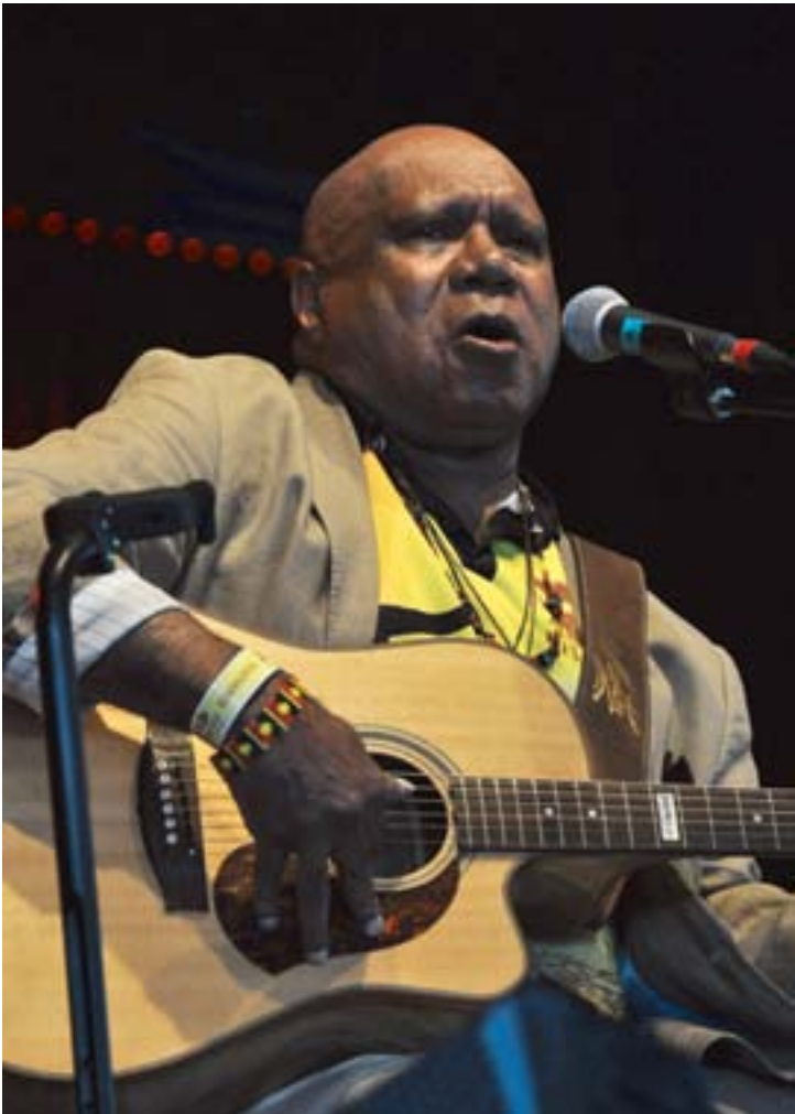
Locals have fond memories of Archie Roach performing at Coonawarra.