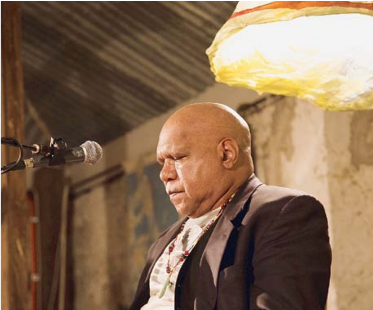
The late Archie Roach at Bellwether Wines at Coonawarra.