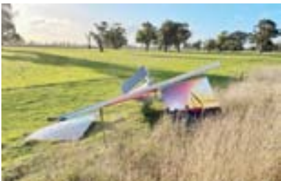
The sign for the Coonawarra Bush Holiday Camp was destroyed by extreme winds.

The Glenroy area is renowned for its strong winds and storms - with tornados happening in recent years.