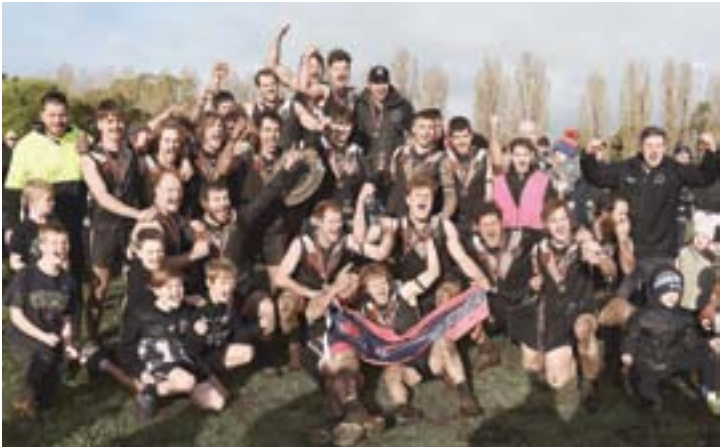
Premiers: Kalangadoo celebrated after a tough slog on grand final day.

too much, with a big crowd in attendance, with umbrellas and rain coats the fashion of the day. Back on the ground and Kalangadoo played the conditions the best, with a real intent to control the game at ground level.