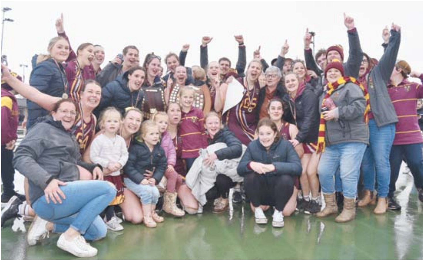
Glencoe's A Grade netballers were joined on court by supporters after a drought-breaking Mid South East premiership victory over Kalangadoo.

When the final whistle blew the Glencoe faithful joined the players on court, with some emotional scenes to follow.