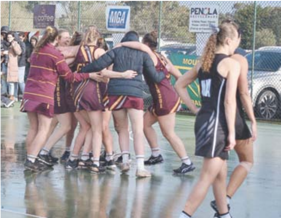
Glencoe A Grade netballers celebrate after the final MSEN A grand final whistle, while Kalangadoo players head despondently back to the bench.