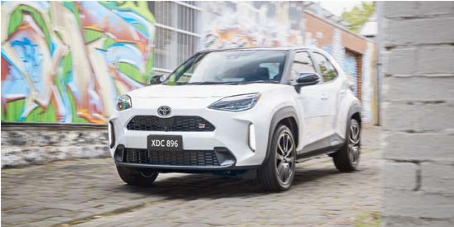
New Toyota Yaris Cross gets styling changes but no extra performance.

Unique 18-inch alloy wheels with a twin-five-spoke design and bright machined finish also help to differentiate GR Sport from the rest of the Yaris Cross range, housing sporty