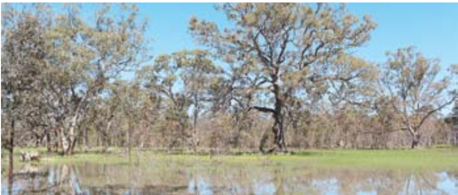
Water is one of the most vital resources to Limestone Coast properties. Picture: FILE Updates on the review and what it will mean for water permit holders is expected later in the year. For more information, visit landscape.sa.gov.au/lc/water-and-coast/water-allocation-plans/lower-limestone-coast

Limestone Coast Landscape Board (LCLB) has started its review in the the Lower Limestone Coast Water Allocation Program (WAP). LCLB chair Penny Schulz told The Border Watch that the review has been under way for around three months now and is expected to be completed by the end of 2023. "It's quite a controversial water allocation plan, and that's partly because it's such a complex water resource with lots of different industries in it," she said. "We're pretty excited that's underway, we've got a fantastic stakeholder advisory group that's already met twice and they're working through that challenging work."