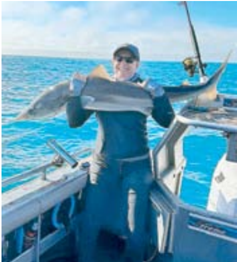
Want To Fish charters were also in on the act, putting their clients onto some nice shark.

There have been plenty of anglers walking the sand flats of the estuary this week, flicking soft plastics for bream and finding some good