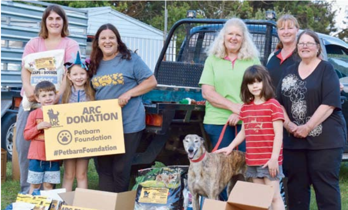
GIVEAWAY: Animal Rescue Cooperative held a pet food giveaway for Glencoe and the surrounding communities.