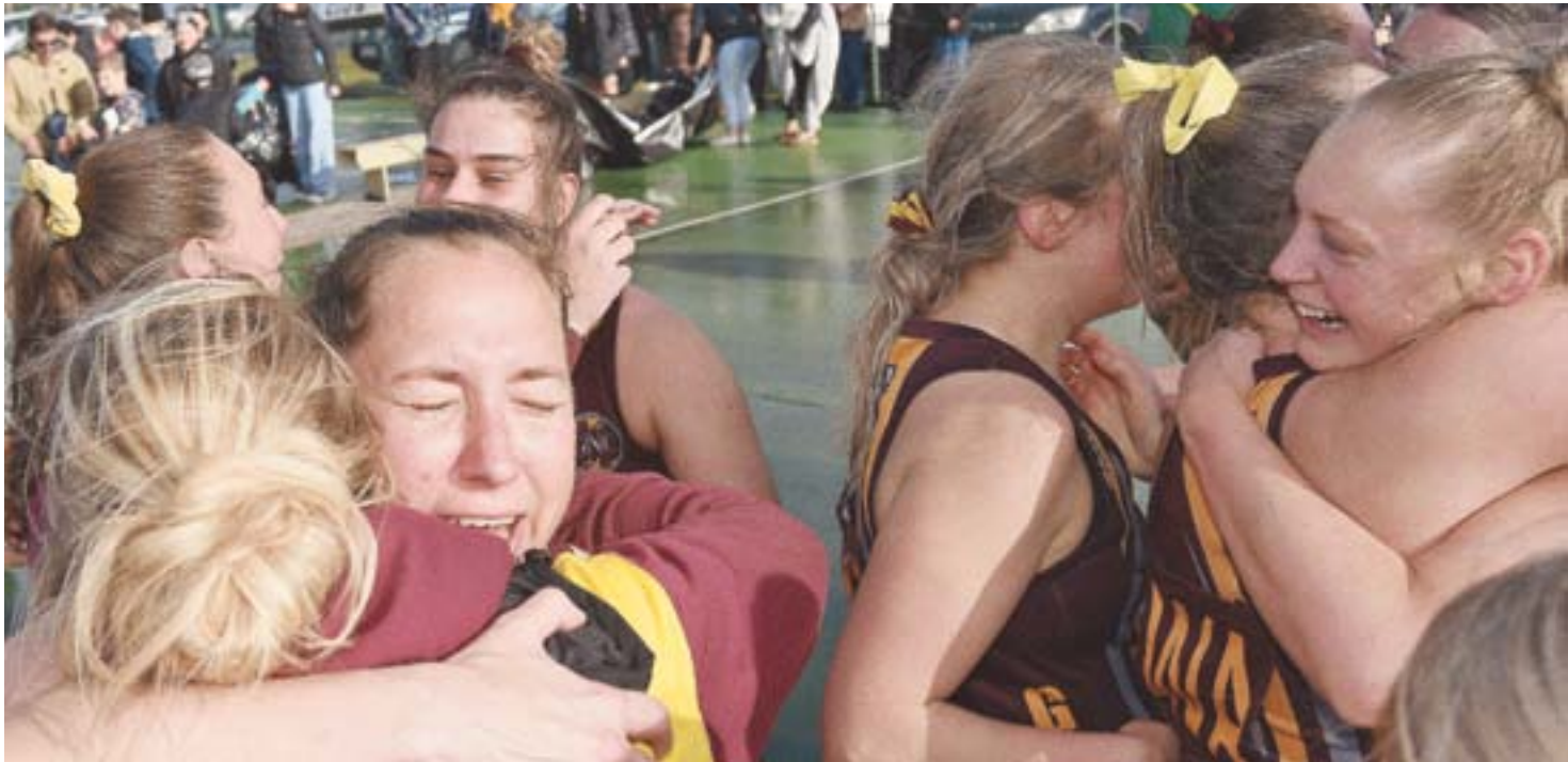
Emotions flowed over as Glencoe claimed the MSEN A Grade netball premiership.