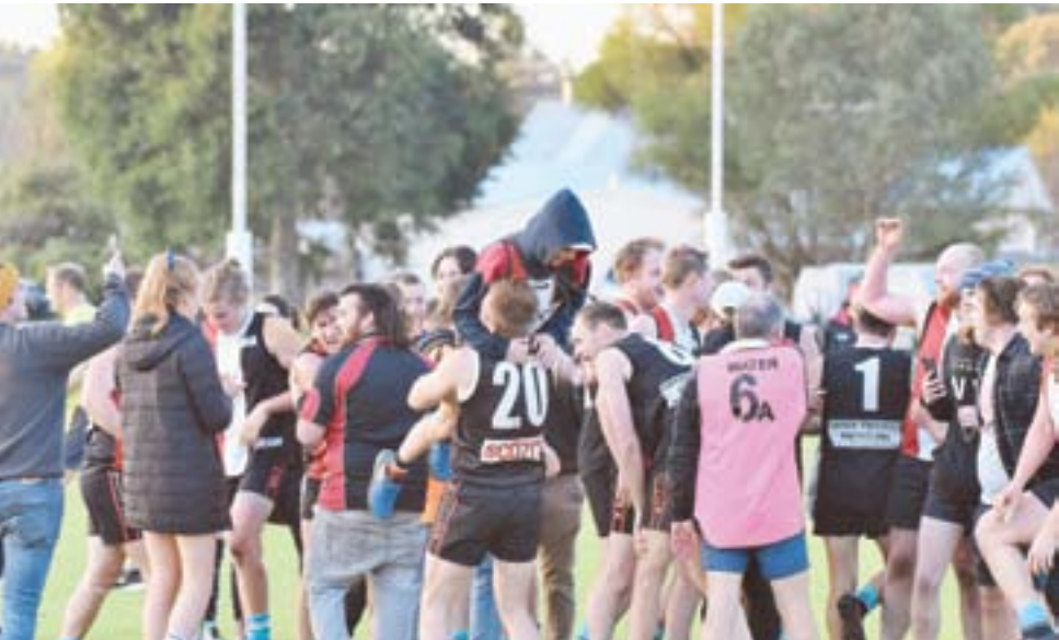
Nangwarry players and supporters come together after the Saints first win since 2014.