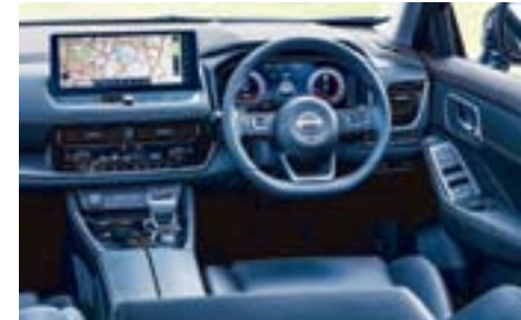
The new X-Trail will be available in the choice of either a five-seat or seven-seat variant.

An all-LED slimline lighting package front and rear, with bright multi-reflector LEDs for high and low beam driving and wraparound boomerang-shaped tail lights, complements