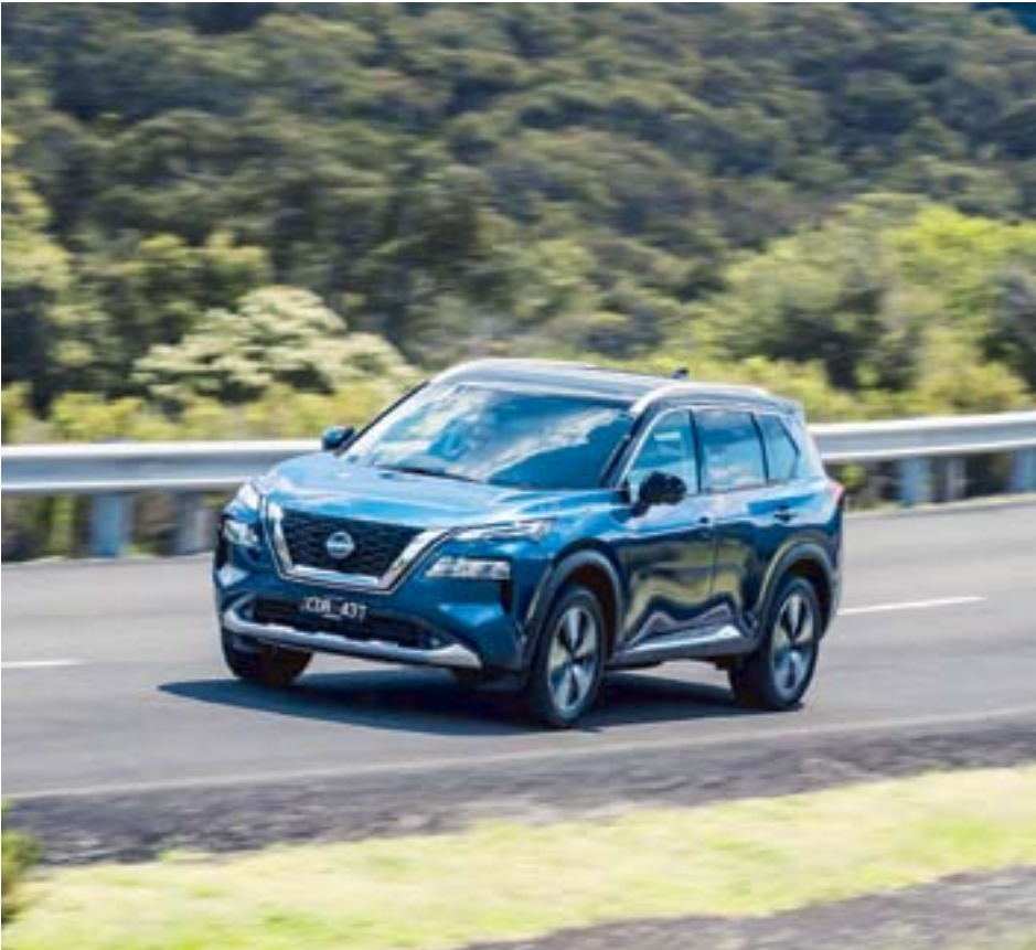
The latest Nissan X-Trail gets extra safety and a power boost.

New X-Trail is priced from $40,424 driveaway for the two-wheel drive ST up to $57,340 for the top-of-the-line Ti-L.