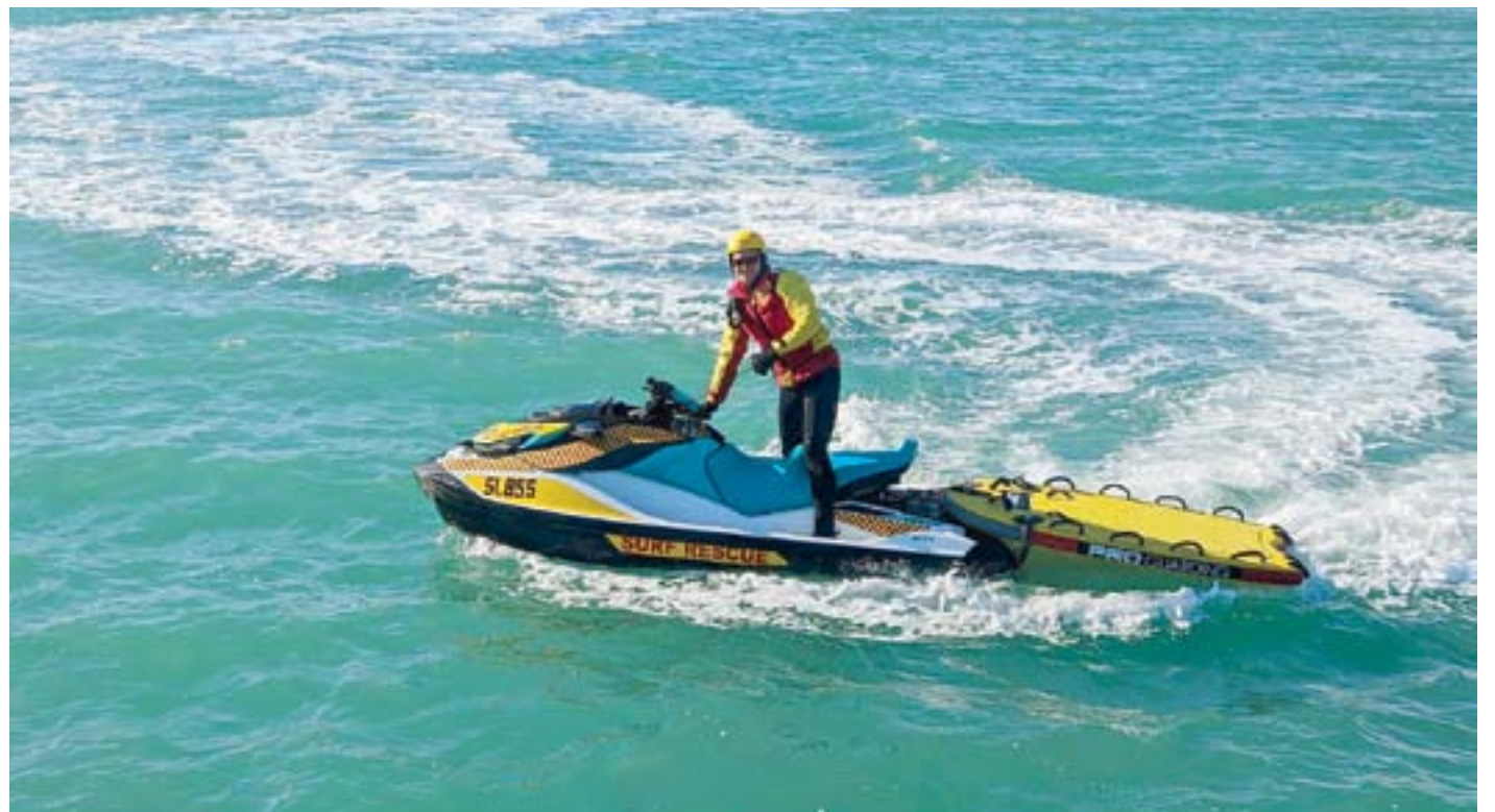
Beachport Surf Life Saving Club is now home to a jet ski that will be on hand to assist during the jetty swim.