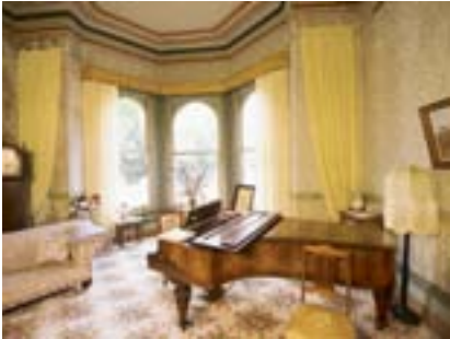
Inside Yallum Park.