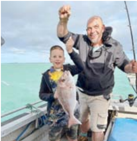
Extreme Marine Charters put these clients onto a nice snapper.

numbers from the carpark all the way down to the mouth.