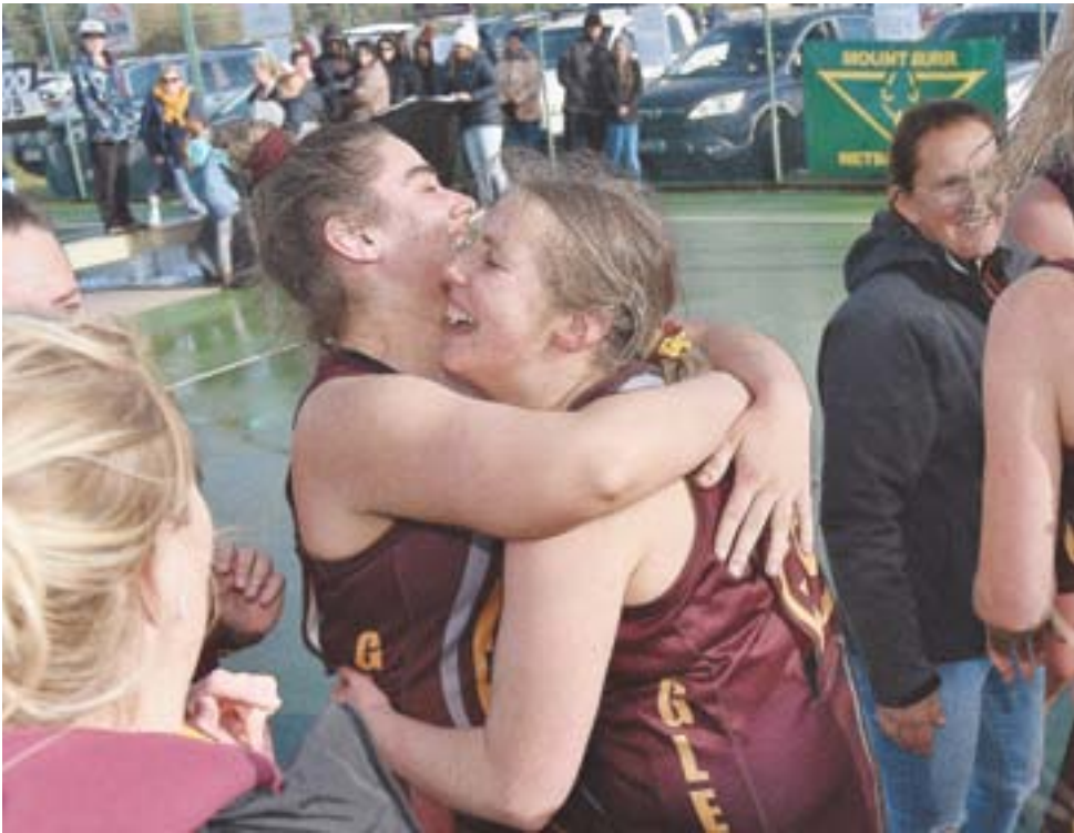
Smiles were hard to hide, even through the tears of a grand final victory for Glencoe A Grade netballers.